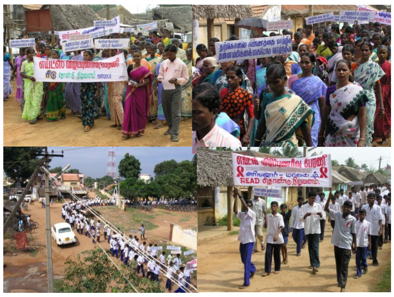
HIV/AIDS awareness rally organized by READ in Andimadam on December 1, 2004

http://news.bbc.co.uk/1/hi/world/south asia/4059219.stm