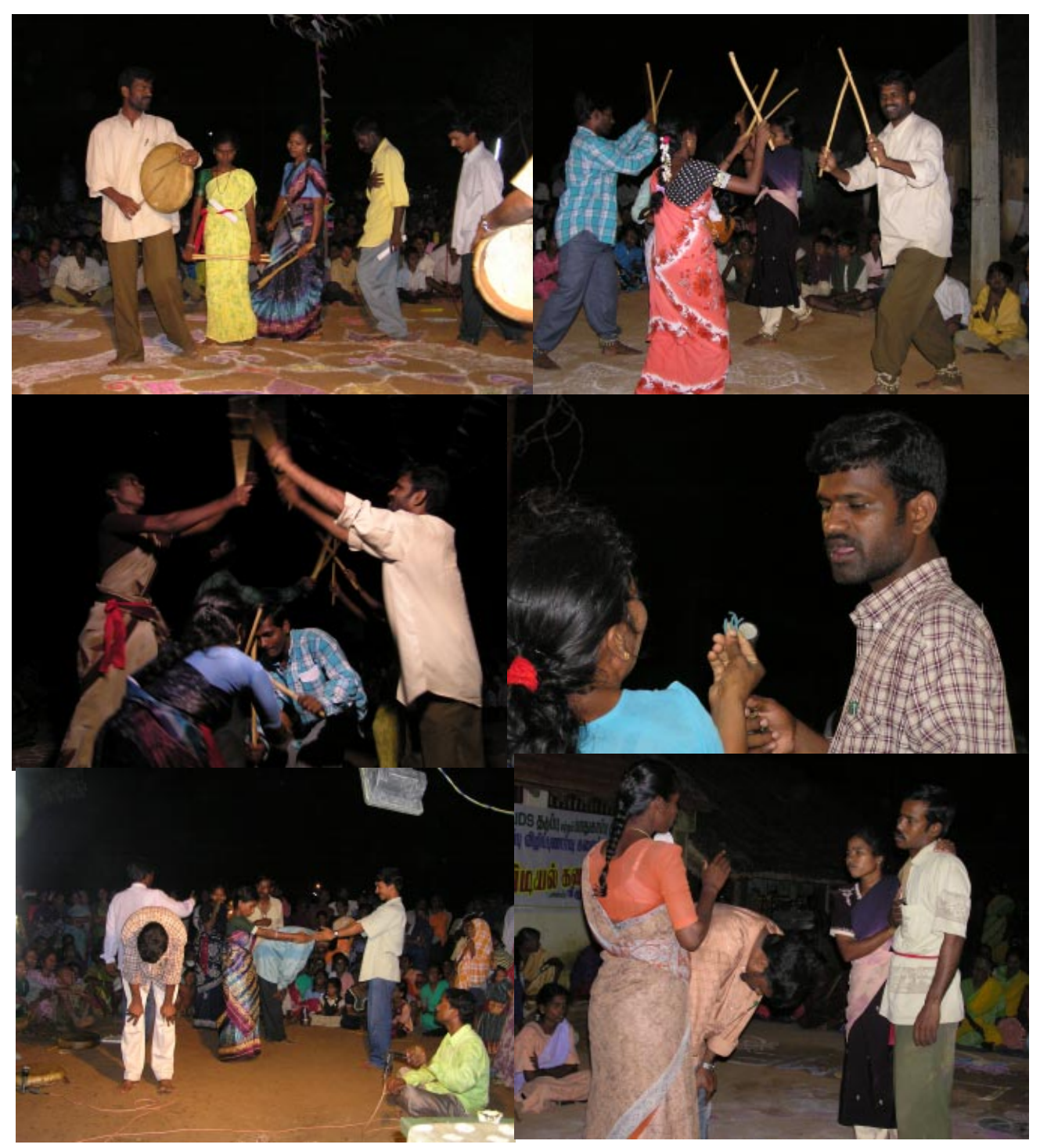
During the evening, READ's cultural team uses street theater to spread correct awareness on HIV to villagers and encourage everyone to help those already affected by this disease.