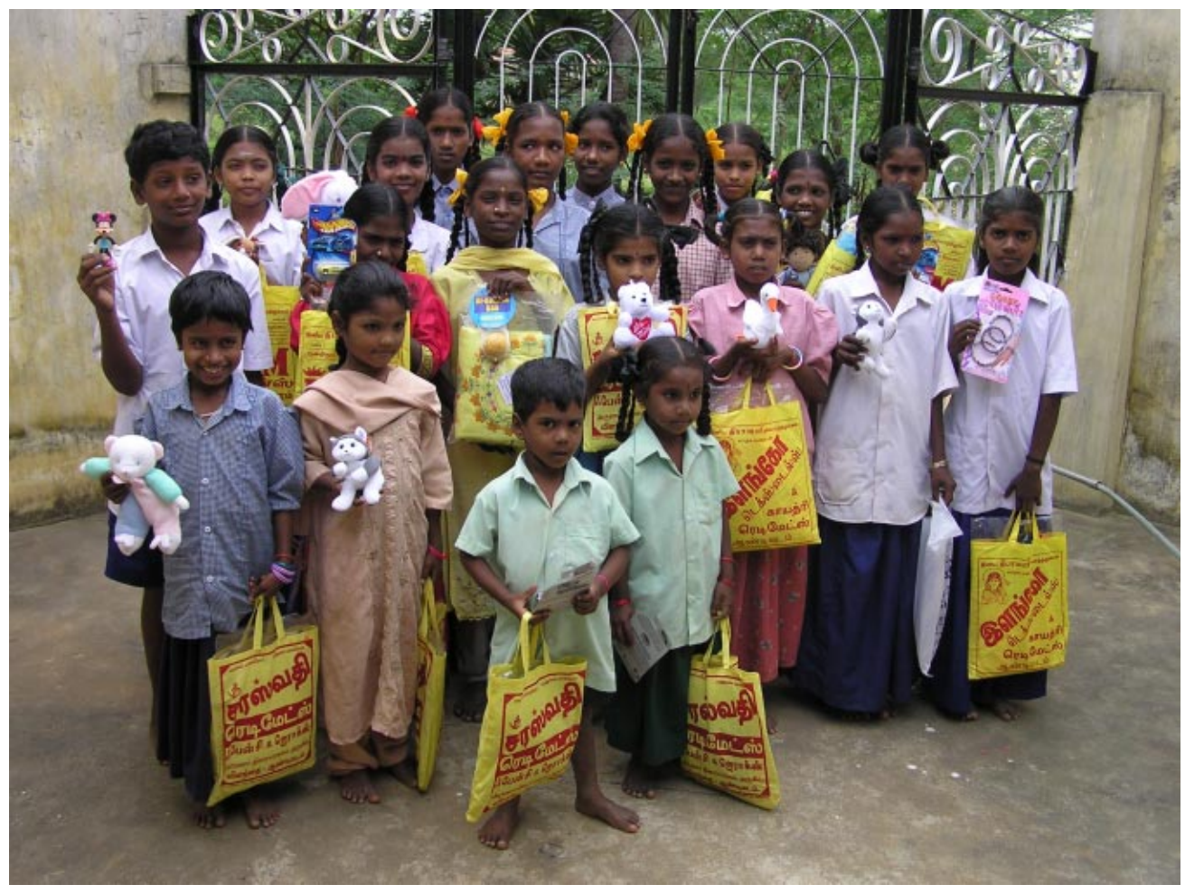
The children in READ's villages who are all sponsored by the Sahaya network of friends and family in the USA and Europe. The children came to READ's training center to collect their school uniforms, and receive toys donated by Sahaya friends in the USA.