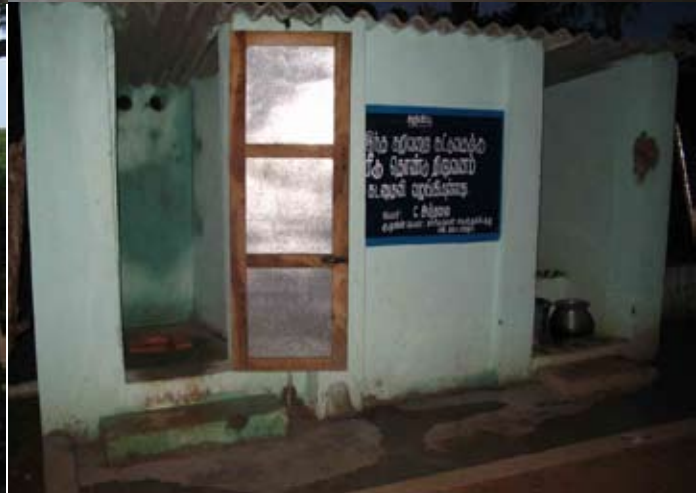
Public Hygiene Program (India): already more than 60 families have been helped in 2006 to construct a family-unit toilet near their hut or house.

toys and games) have been helping many children. For more information about this exciting program, please visit www.tambaramkids.org .