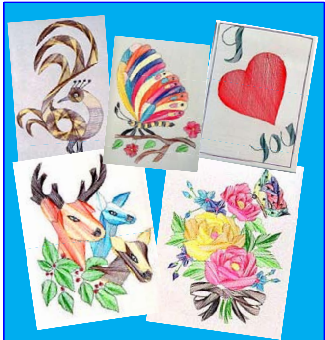
More than 150 different designs of embroidered cards are produced by the trainees of READ to support their programs.

We thank the many volunteers who helped us in all these fundraising efforts. We simply couldn't have done it without you!