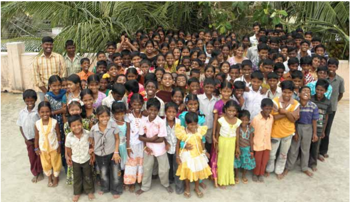
At the end of 2011, approximately 210 children were part of our orphan sponsorship and Hope Walks/Sahaya Walks program.