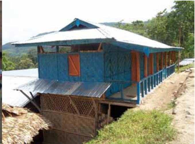
The newly constructed school building for the Lamling Vista School in Nagaland provides education to 130 students ranging from kindergarten to 6th standard.