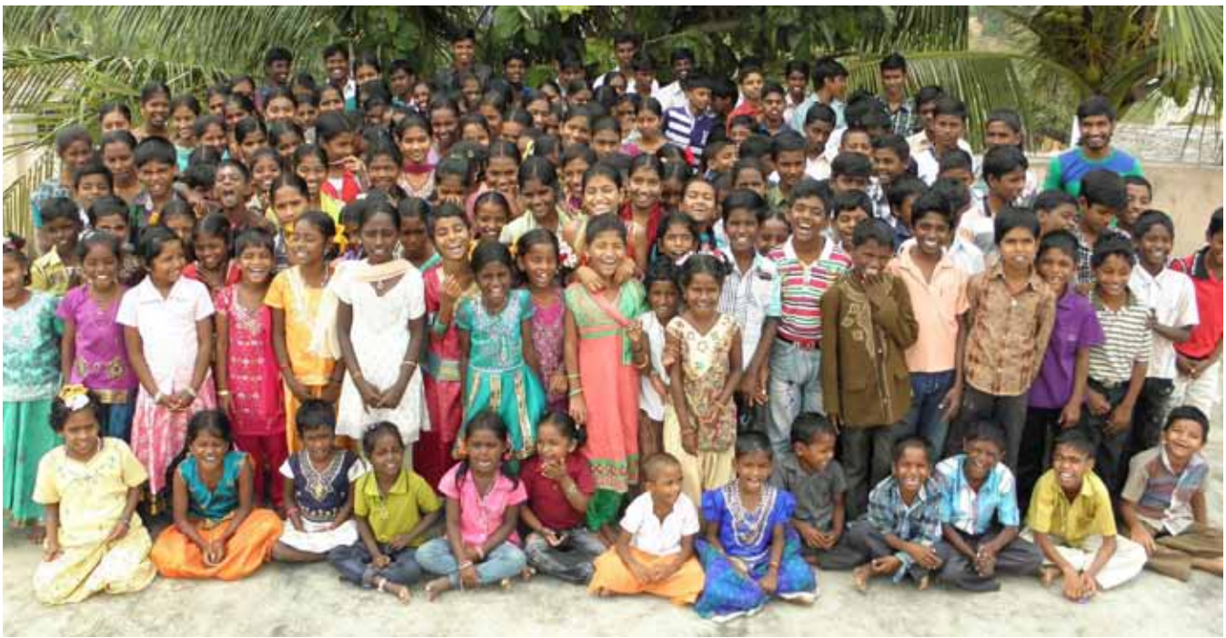
At the end of 2013, approximately 230 children were part of our orphan sponsorship program in India.

network named “Malarum Mottukal” (meaning “blossoming flower”) to assist persons living with HIV/AIDS (PLHIV). The network meets monthly and provides counseling, medical assistance and referrals. The network has currently 170 PLHIV members. Most of them arrive in very destitute situations. Approximately 80-90% of the members are usually able to attend the monthly meetings. During the previous years, the activities of this network were largely supported by consecutive grants of Gilead Sciences, Inc.