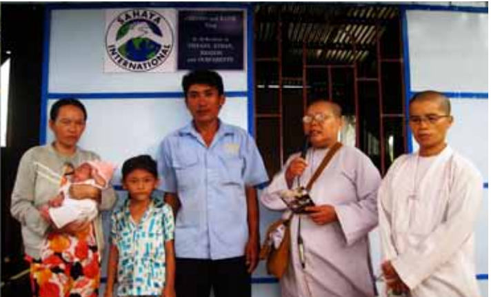
The Sahaya Vietnam Housing program: a family before and after our intervention.