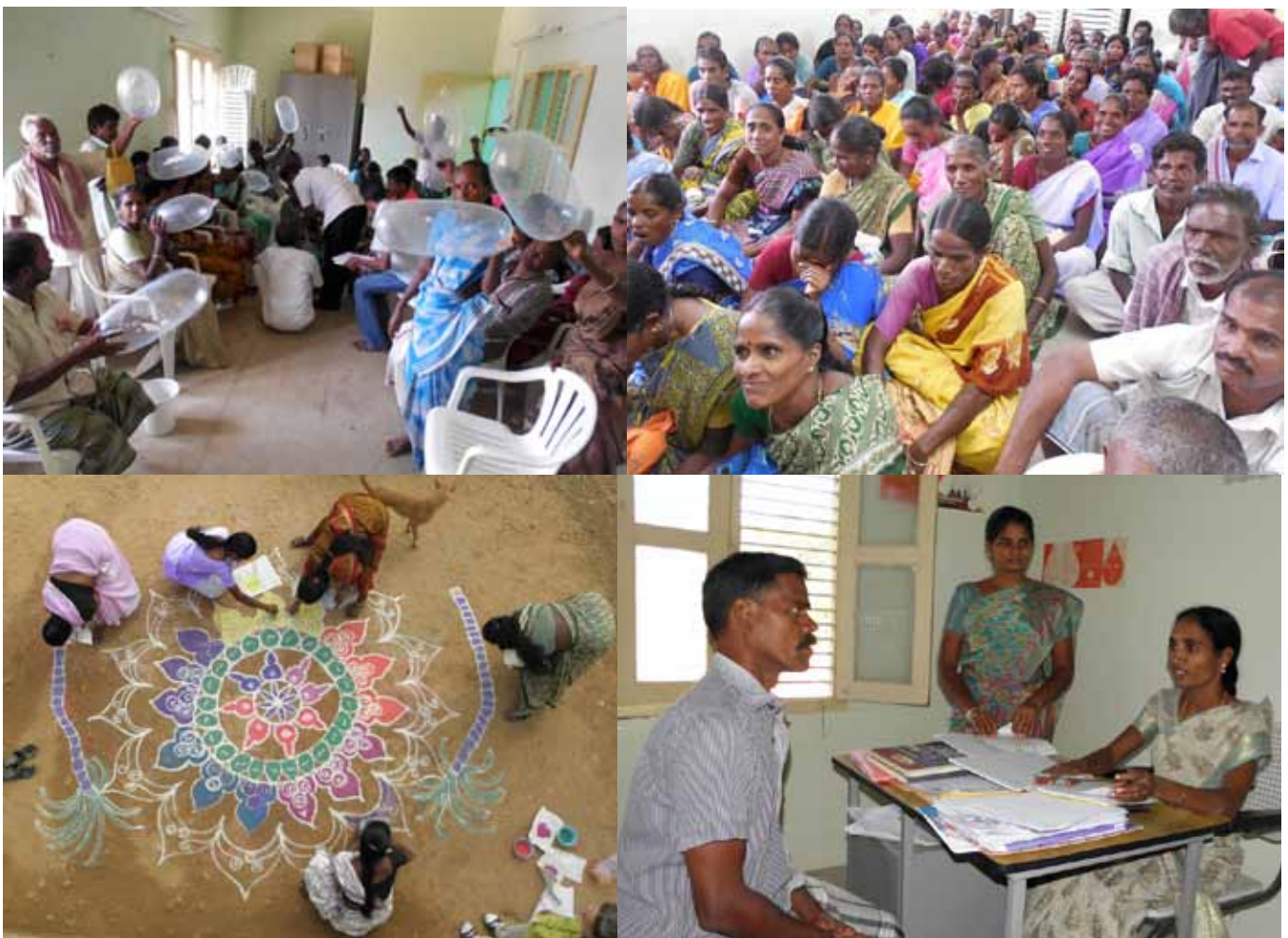
(From top left clockwise): Training on home-based care, including HIV prevention and the importance of consistent condom-use; the monthly HIV network meeting; the HIV network celebrates Pongal festival together; meet monthly; the Gilead Counseling and Health Center.

the part-time counselor also visits PLHIV at their home to provide counseling and assist with conflict resolution.