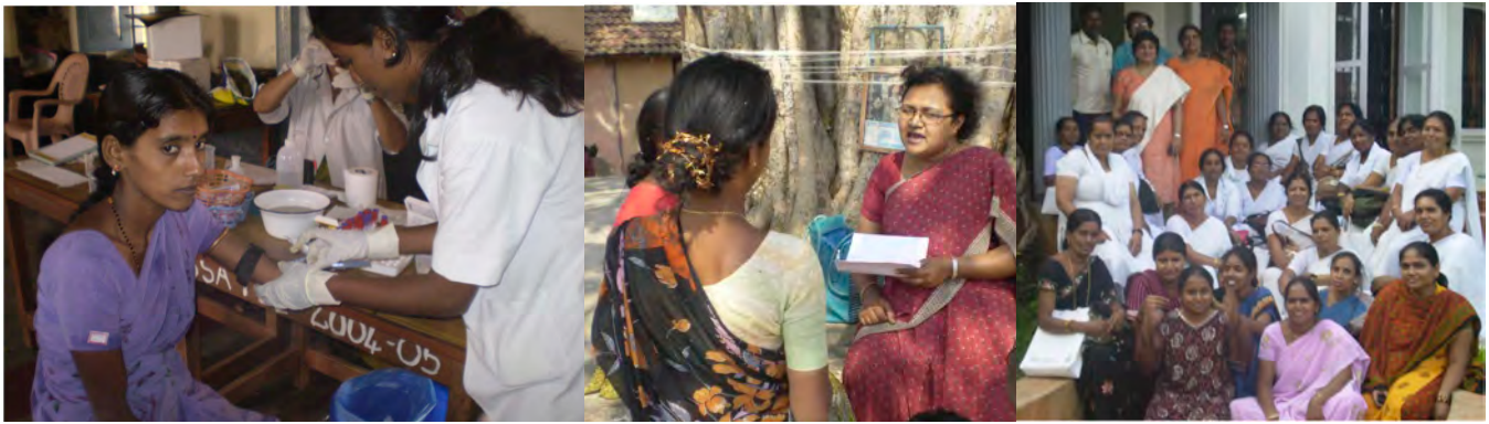
The programs of Prerana Women's Health Initiative and Public Health Research Institute (Mysore, India)