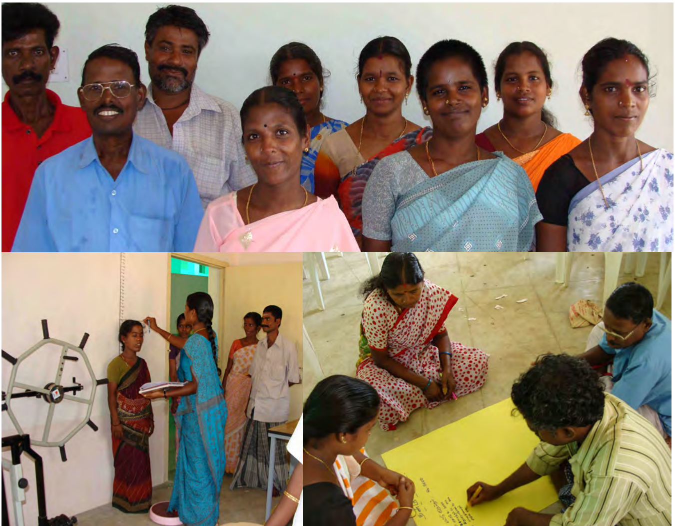
The PLHIV network has elected 9 leaders in 2010 (top). The network members come to the Gilead Health & Counseling Center (lower left), and some received training on micro-loans and micro-enterprise (lower right).

The Gilead Health & Counseling Center was