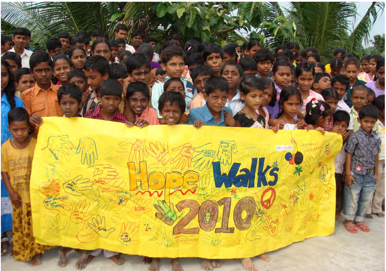
The children of our orphan sponsorship program and Hope Walks program display the banner that was made by children and youth in Davis during the 2010 Hope Walks Davis event (see page 12).