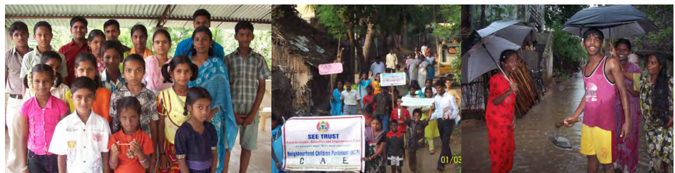
SEE Trust organizes Children’s Parliaments and gets them involved in community work.

SEE Trust (Socio-economic Education and Empowerment Trust) is an registered, non-governmental organization committed to the welfare of downtrodden and marginalized women