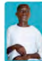
The cover and 2 sample pages of the 2nd edition of the Deaf Peers Health Manual.

Sexual Health - Roleplay A roleplay activity to ensure that the information on the manual is understood and practiced by the role-actors to ensure a complete understanding of the manual.