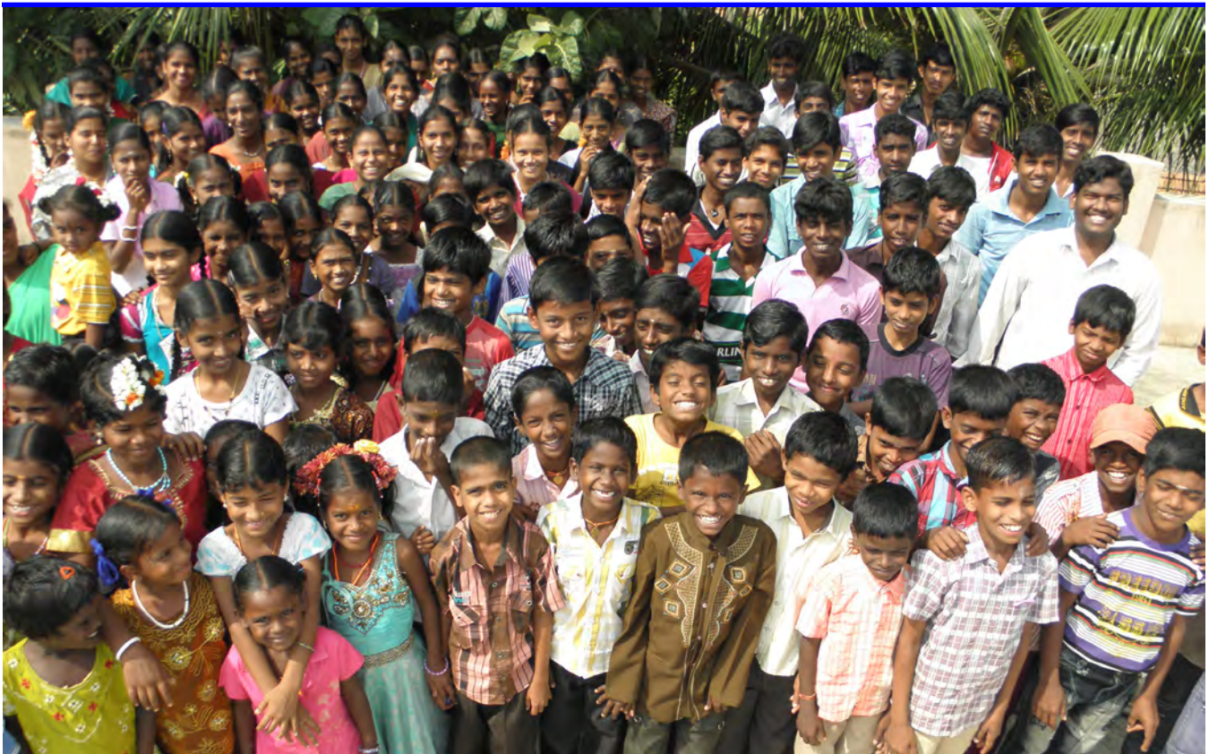
At the end of 2012, approximately 210 children were part of our orphan sponsorship program in India.