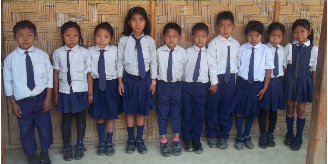
The newly constructed school building for the Lamling Vista School in Nagaland provides education to 150 students ranging from kindergarten to 6th standard.

pay for half of the cost. This involvement from the parents is very encouraging, because it means that they are beginning to own their children's education. It also gives us hope that the parents will continue to educate their kids beyond elementary school at Lamling Vista.