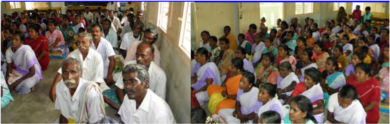
The PLHIV network at READ, supported by grant support from the Gilead Foundation via Sahaya International.