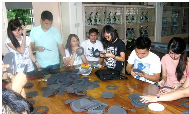
Students of Xavier University making ovitraps.