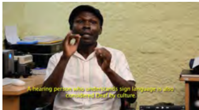
HIV Awareness of the Deaf (Kenya). Part 1 of the short film captures what deafness is, who a Deaf person is, mode of communication, and culture. Above are a few screenshots of the video ( www.vimeo.com/126270157 ).