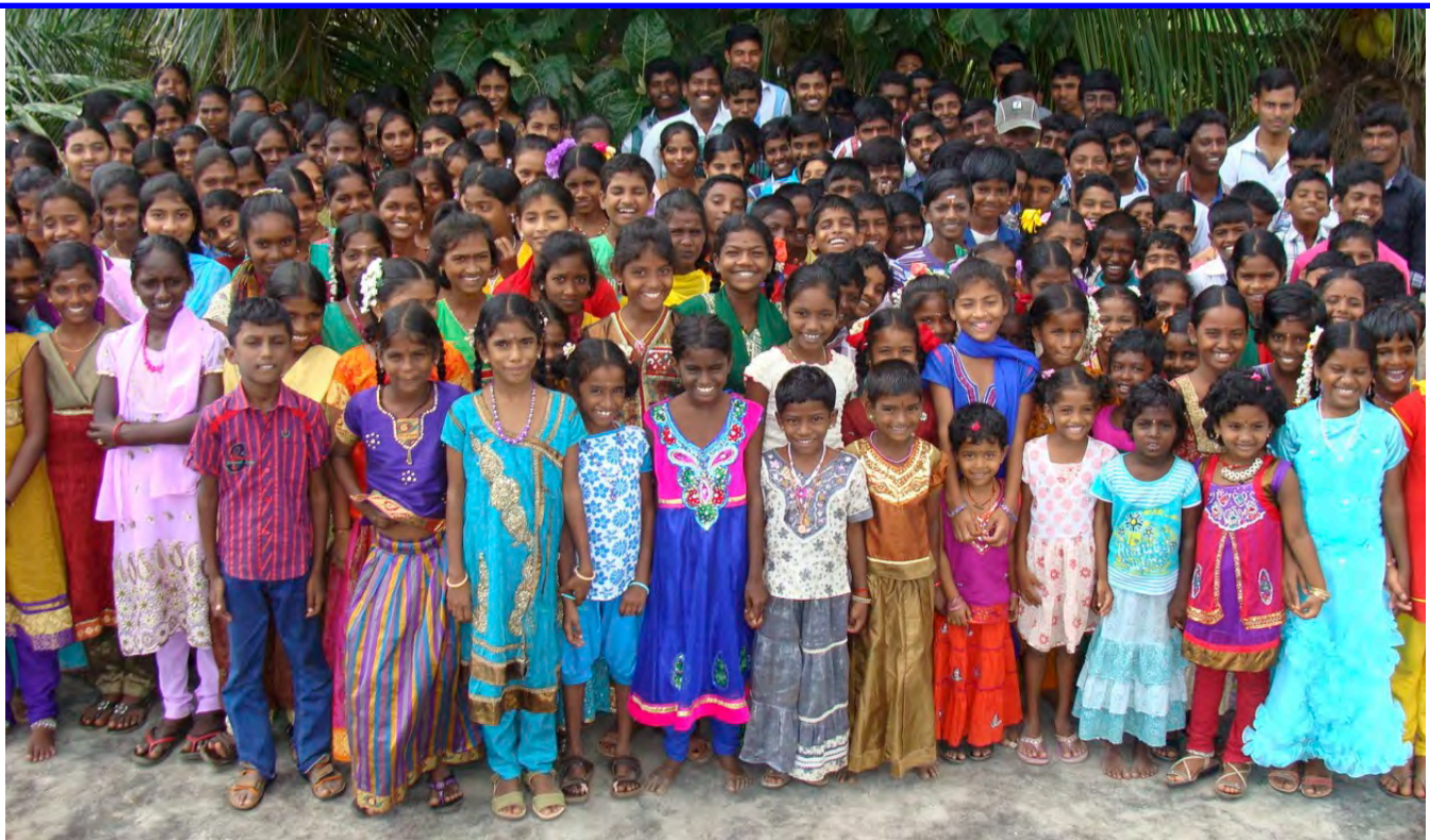
At the end of 2014, approximately 230 children were part of our orphan sponsorship program in India.

network named “Malarum Mottukal” (meaning “blossoming flower”) to assist persons living with HIV/AIDS (PLHIV). The network meets monthly and provides counseling, medical assistance and referrals. The network has currently 178 PLHIV members. Most of them arrive in very destitute situations. Approximately 80-90% of the members are usually able to attend the monthly meetings. During the previous years, the activities of this network were largely supported by consecutive grants of Gilead Sciences, Inc.