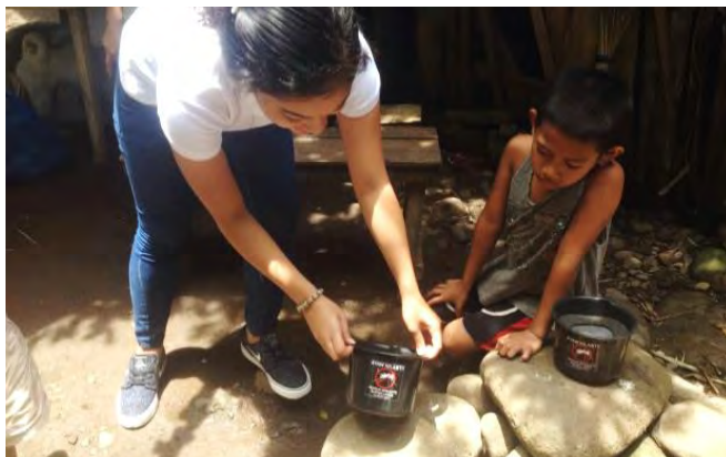
Monitoring of mosquito larvae.