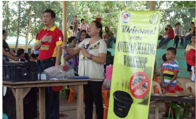
Seminar on making ovitraps.