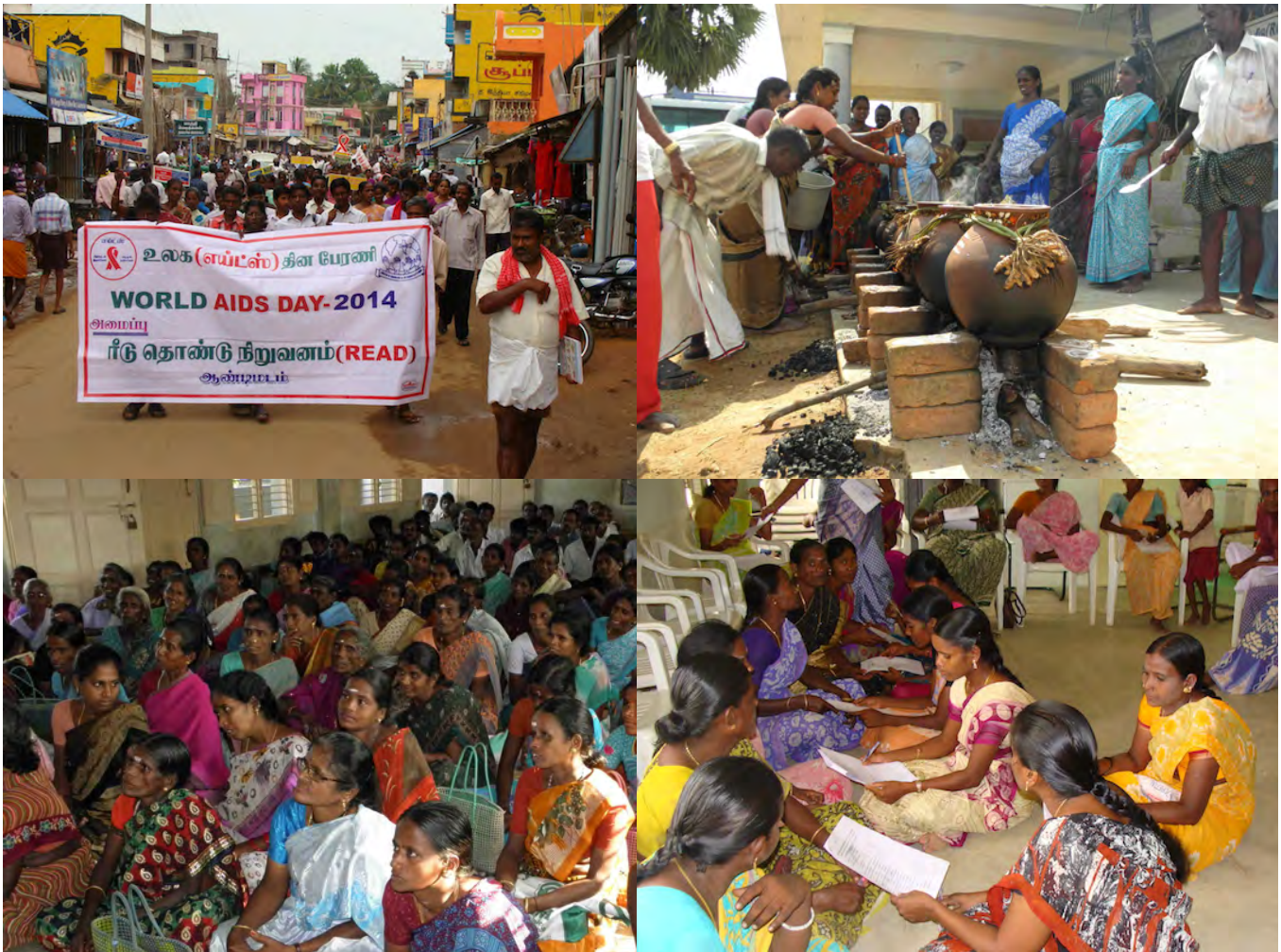
(From top left clockwise): HIV awareness rally; the HIV network celebrates social Pongal festival together; the monthly meeting; training on home-based care.