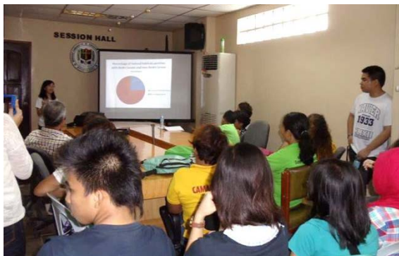
Presentation of results by Bio 58L-YA in Brgy Carmaman-an