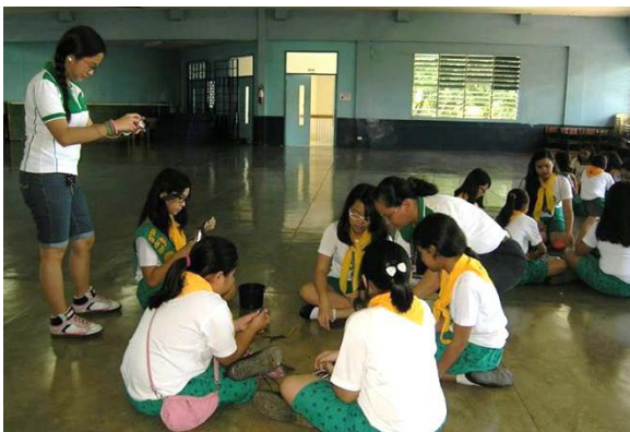
Ovitrap-making was also taught to XU Grade School Girls Scouts to install at their school