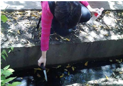
Sampling for Aedes larvae in Brgy Carmen