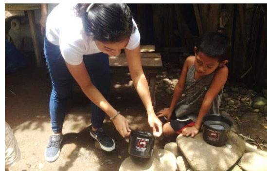
Monitoring of mosquito larvae in Brgy Camaman-an