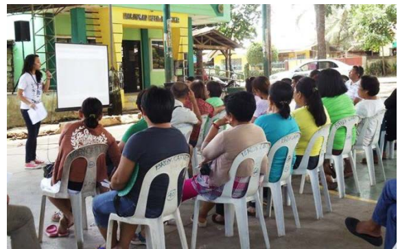
Presentation of results by Bio 58L-YB in Brgy Carmen